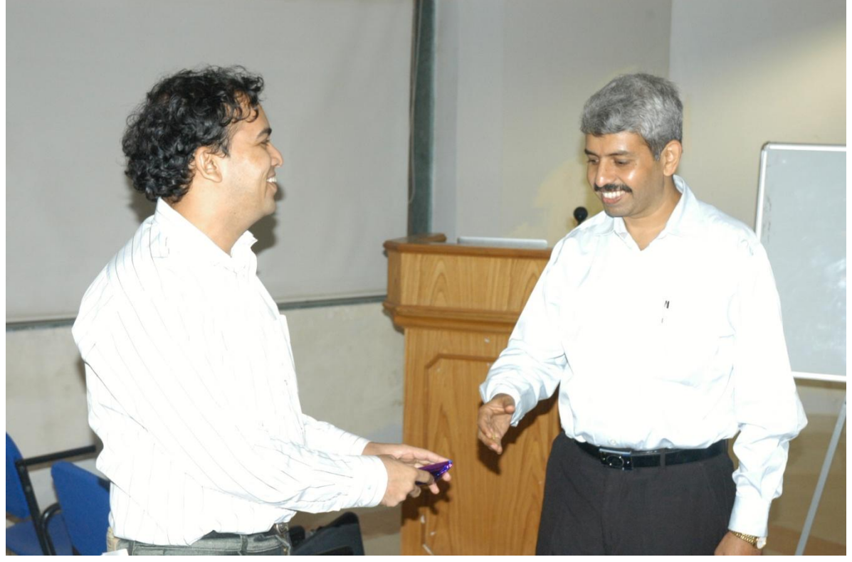
Hemant Dhamne's Special effect photo bagged 1<sup>st</sup> Rank in Photo Contest