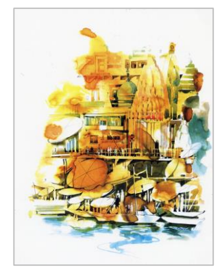
Pride of India Award by Socially Point Foundation - 2023