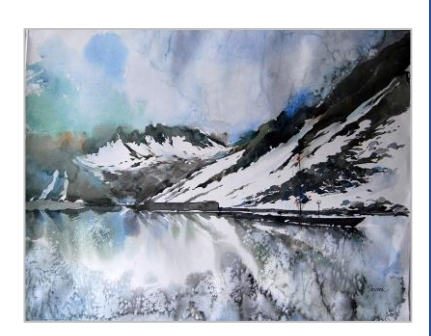
London Book of World Records - 2023