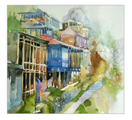
Vande Mataram Award by Anuragyam, Govt. of India, 2024